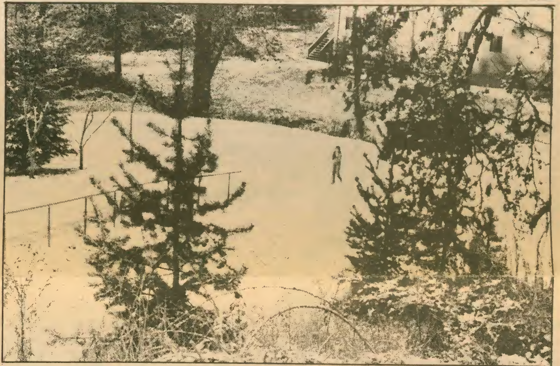
Snow and ice forced cancellation of classes last Monday.

The snow also forced the postponement of last Monday's Chehalem Symphony orchestra concert to next Monday, Dec. 9.